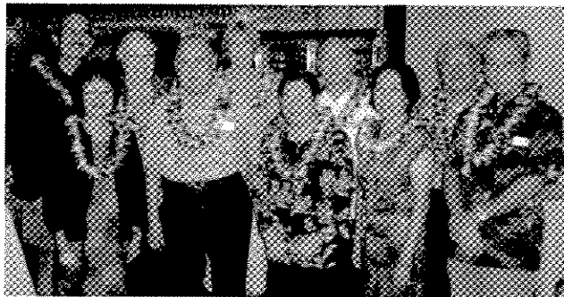
The Oo Syak Board of Directors.