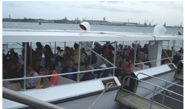
All participants who joined the Pearl Harbor Boat Tour