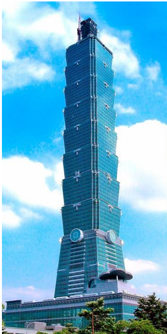
Taipei 101 – The world's tallest building

Have you been looking for an opportunity to travel and study abroad? Looking for a way to send your child away for the summer? A great opportunity has been extended to the students in OSGL for an educational summer program. It is a four-week program in Taiwan for students ages 16-27.