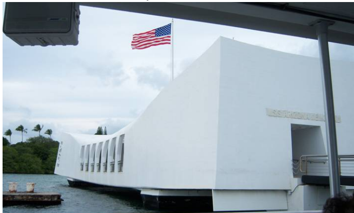
USS Arizona Memorial

The tour also covered the West, Middle, and East Loch shorelines, the Waipio and Pearl City peninsulas, and the site where the Walt Disney movie “Pearl Harbor” was filmed. At the conclusion of the tour, we made a private visit to the USS Arizona Memorial.