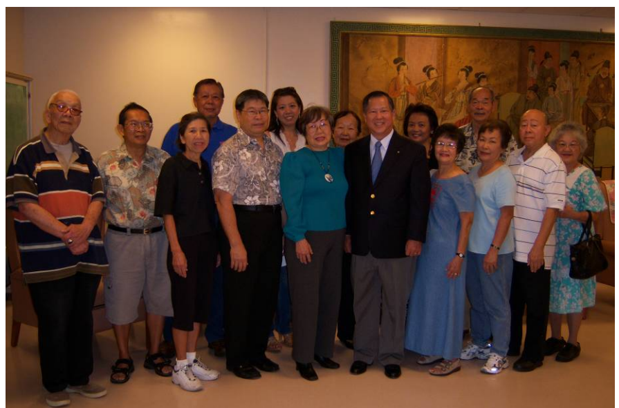
The group of Oo Syak members who visited Palolo Chinese Home in April.