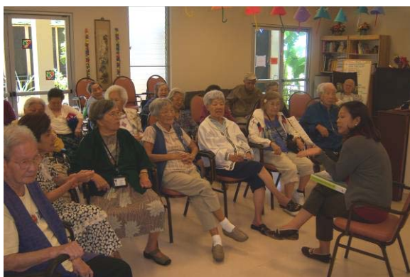
Day care participants stimulating their minds by playing question and answer games in the activity room of Palolo Chinese Home.