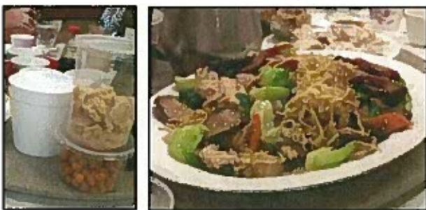
Scrumptious appetizers and house special cake noodles for long life!

If you missed the banquet this year, try to get in on it next year. Mark in on your calendar already for August 2010!