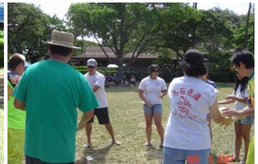
Members enjoying a game of not "hot potato", but "hot bu-look".