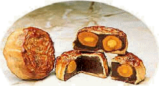
Delicious moon cakes

HONOLULU CHINATOWN MOON FESTIVAL When: Saturday, September 14 th from 5:00pm – 10:00pm Sunday, September 15 th from 10:00am – 10:00pm Where: Chinese Cultural Plaza