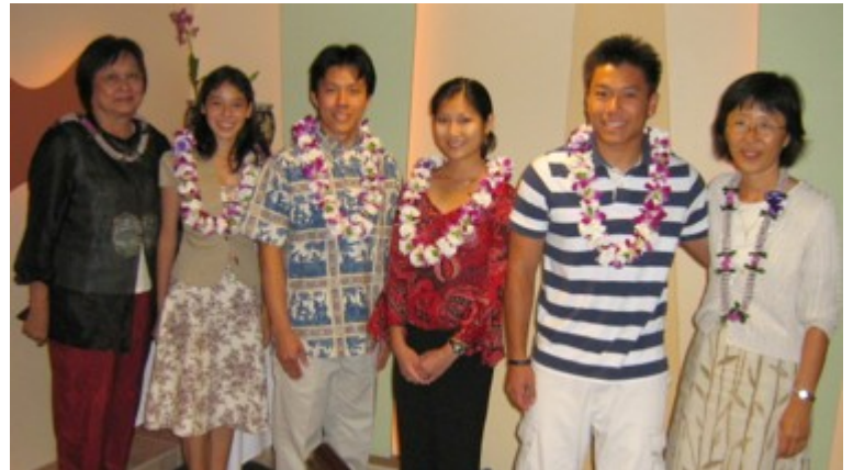
Our judges with our four scholarship recipients.

For details on our scholarship winners and their goals, please turn to page 5.