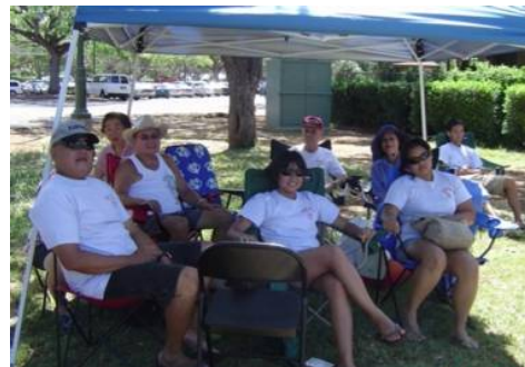
Oo Syak members brought a tent to relax in the shade.