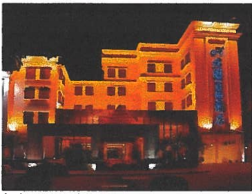
Junhao International Hotel 4.3/5 Excellent $34