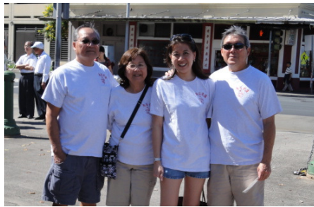
Oo Syak Gee Lu attendees.