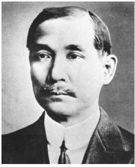
Dr. Sun Yat-Sen