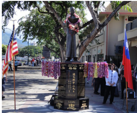
Leis presented to the Dr. Sun Yet Sen statue on River Street in the Chinese Cultural Plaza Mall by Chinese societies and organizations from Honolulu.