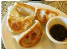
Wrapped Chinese dumplings, jiaozi .