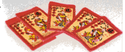
Red lisee envelopes.

Money packets wrapped in red envelopes and decorated with gold are given to children.