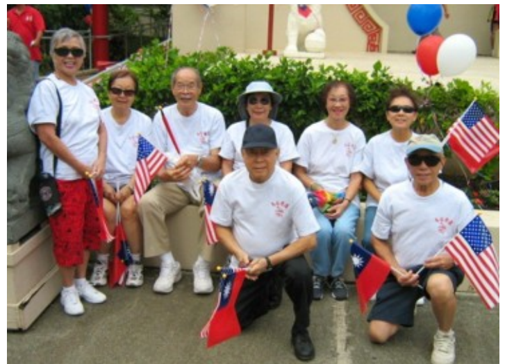
More members gathering before the parade.