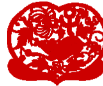
Left: Chinese papercuts originating in the Han Dynasty.

Many people hang a poster of the Kitchen God in the kitchen. The Kitchen God is superstitiously known to report on the family's behavior when he returns to Heaven. Offerings usually include sticky rice cake, or nian gao , and children offer him honey.