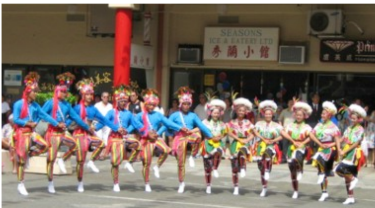
Taiwanese aboriginal dancing entertainment.