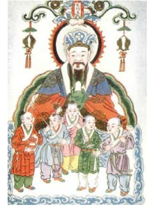
The Chinese Kitchen God.