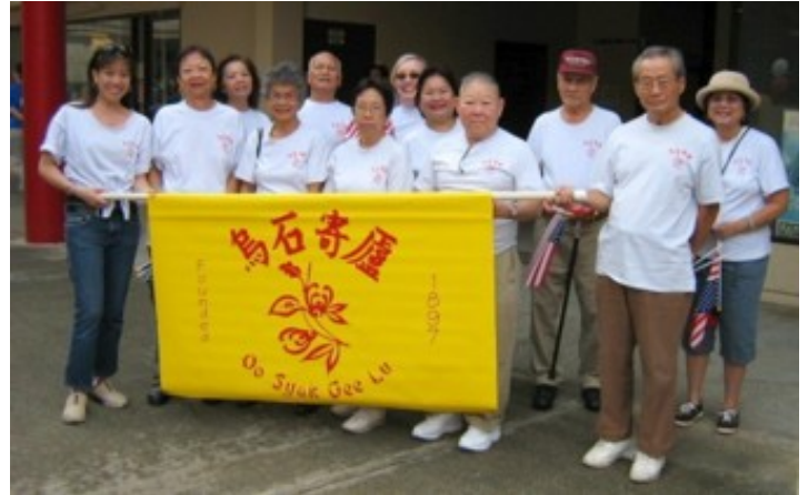
Members before the parade in the Chinese Cultural Plaza.

For more photos, please visit our website at http://www.geocities.com/echang55/dblten07.html .