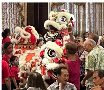
Lions moving thru the crowd.