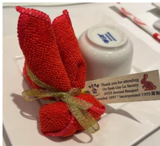
Rabbit washcloth favors.