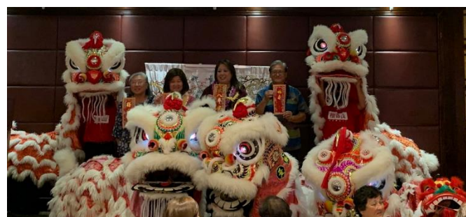
Lion Dance performance by Majestic Culture & Arts Association provided six lions (three adults, and two babies, and a newborn).