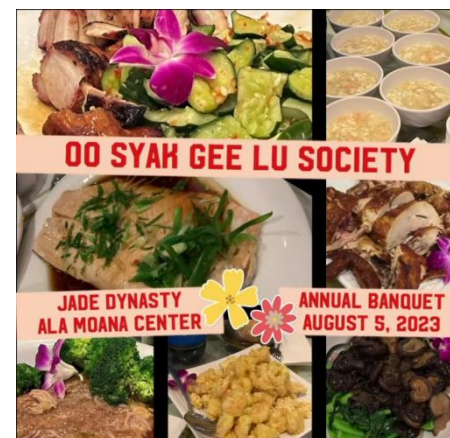
Eight course dinner provided by Jade Dynasty.