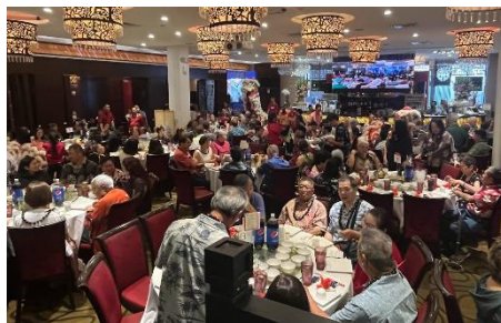
A packed restaurant at Jade Dynasty.